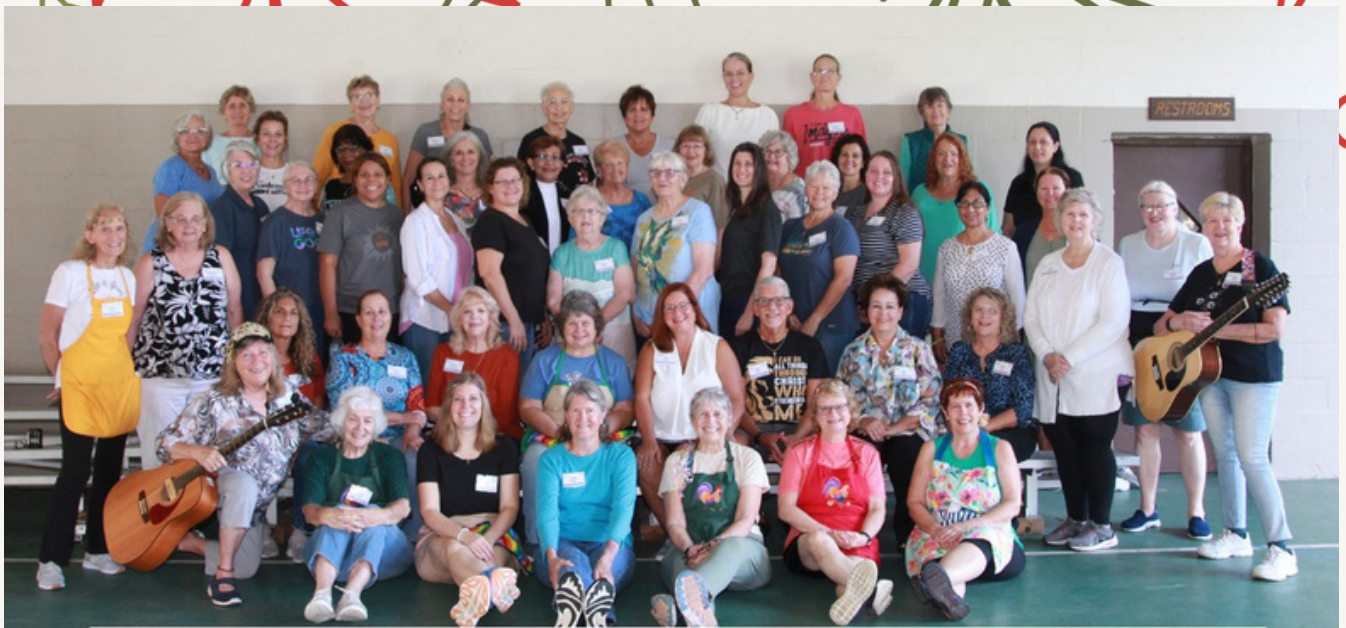
ALDERSGATE EMMAUS October 2023 Leesburg, Florida Ladies Walk #161