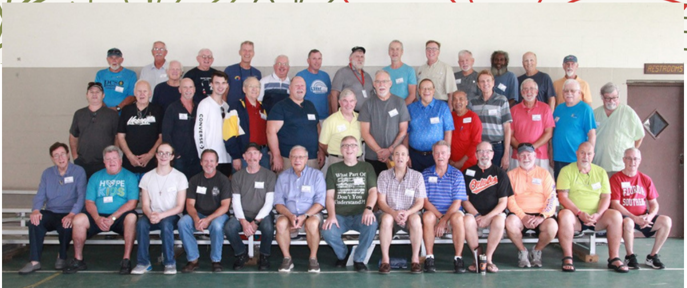
ALDERSGATE EMMAUS October 2023 Leesburg, Florida Men's Walk #161