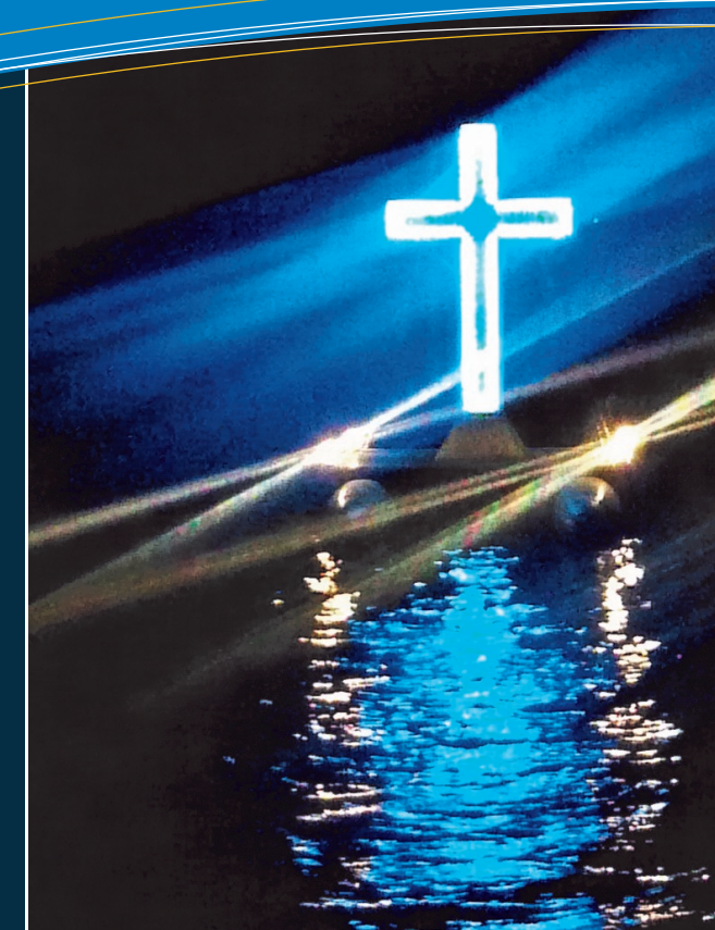
Leesburg's Cross taken with a cell phone on the Men's Walk #135 in October 2011.