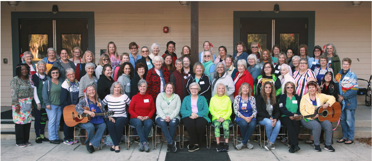
ALDRSGATE EMMAUS October 2022 Leesburg, Florida Women's Walk #159