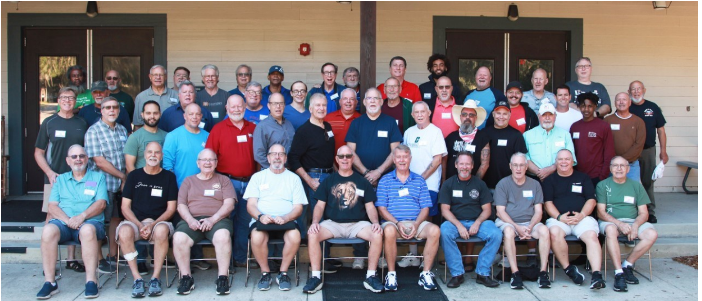
ALDRSGATE EMMAUS October 2022 Leesburg, Florida Men's Walk #159