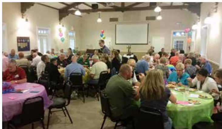
BELOW: The Central Florida Cluster officially welcomed the March Babe Chicks to the community at the event held in the Fellowship Hall of the church. Of course, there was a potluck dinner.